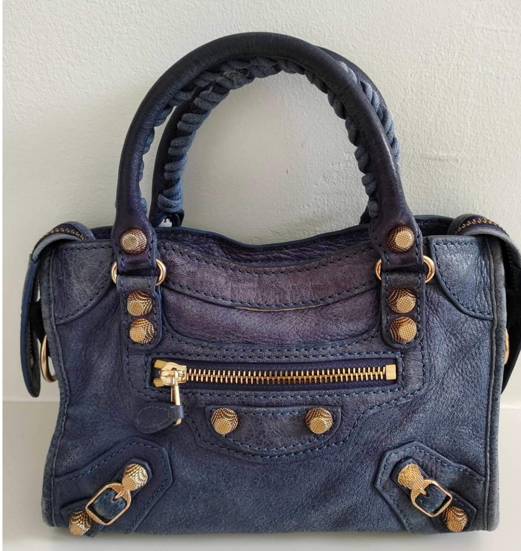
FULL BAG FROM ALL SIDES